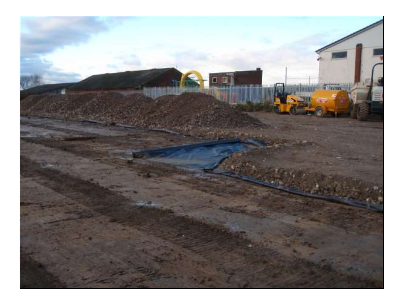
Plate 2. Construction compound being built (looking east)