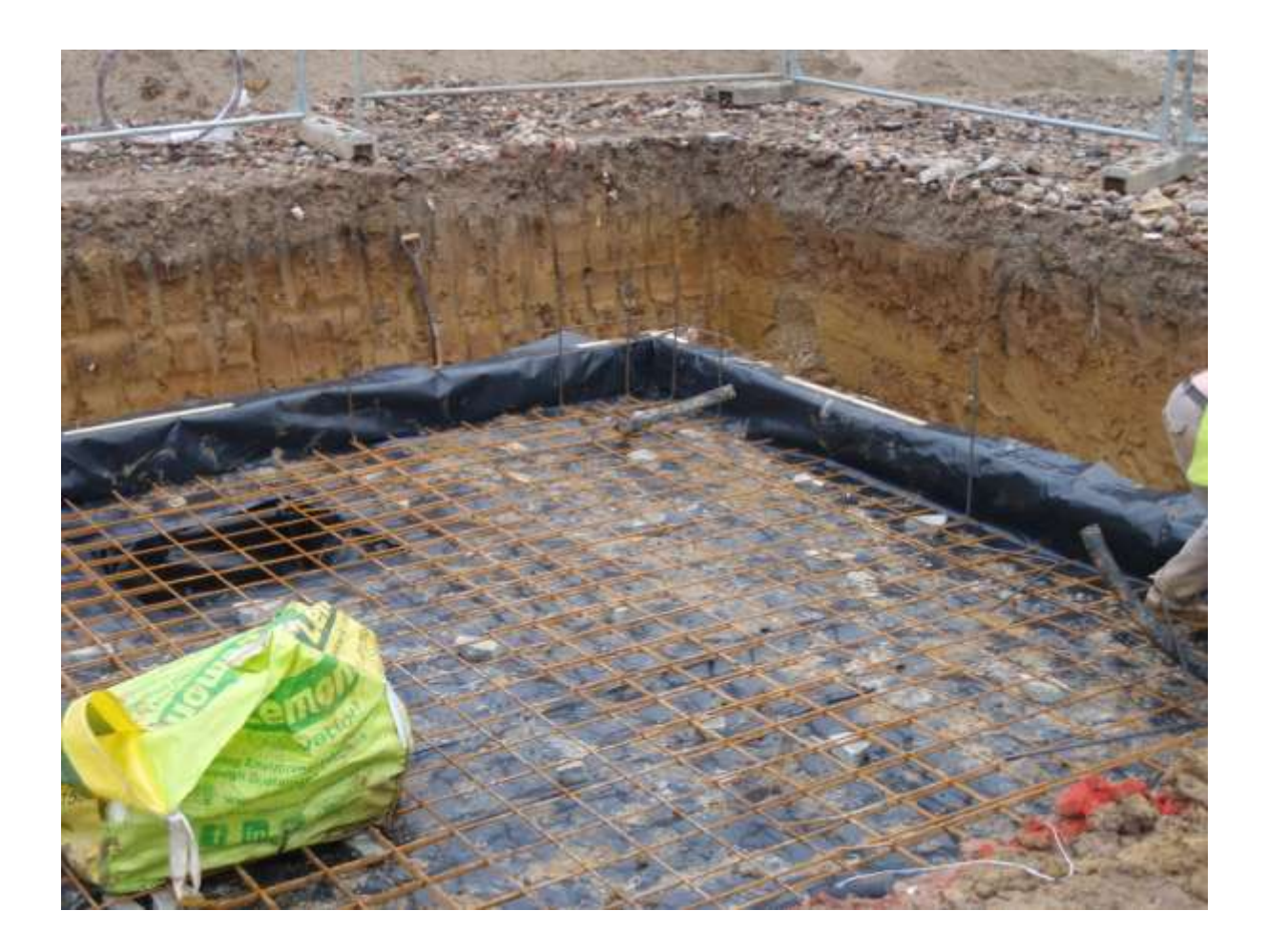
Plate 6. Main inverter building under construction (looking north).