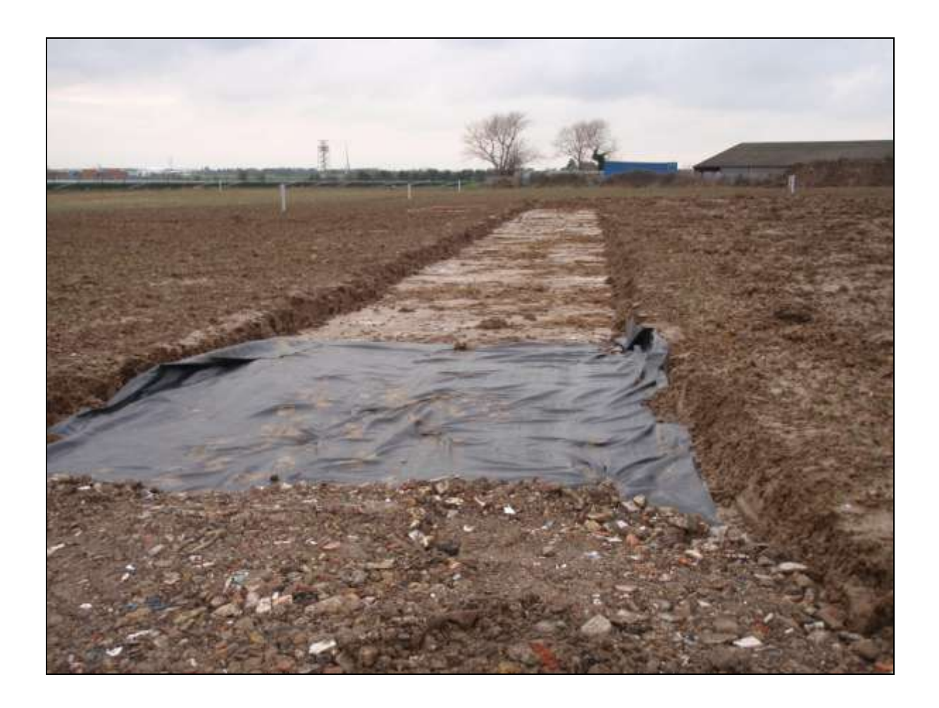
Plate 3. Construction of maintenance road (looking south-east)