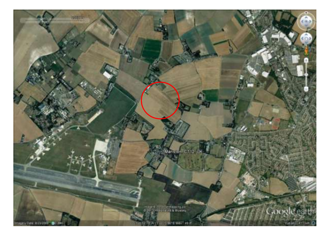
Plate 1. Aerial view of site (Google Earth 2003)

Plate 1 Aerial view of site Plate 2 Construction of compound Plate 3 Maintenance road construction Plate 4 Main cable runs Plate 5 Piling in progress Plate 6 Main inverter construction